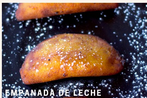
EMPANADA DE LECHE