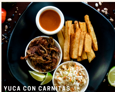
YUCA CON CARNITAS